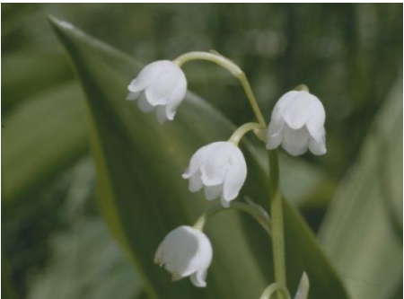
Clowes Wood

Preferred habitat niches: Dry woods, scrub and hedgebanks usually on base rich soil. Most frequent in ashwoods in N and W Britain but also occurs in ancient woods on sandy boulder clay over chalk in East Anglia and in grikes in limestone pavement. Likes semi-shade and rarely in full light.