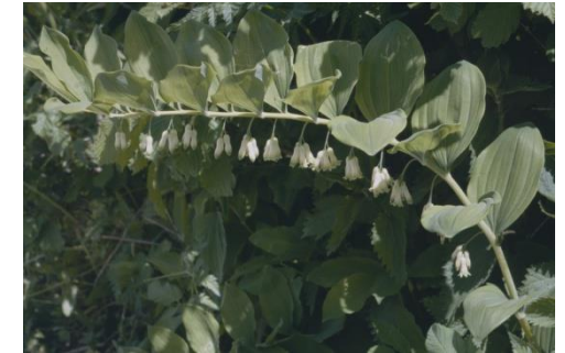
Varta Valley