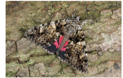
Light Crimson Underwing © David Green