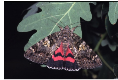
Dark Crimson Underwing