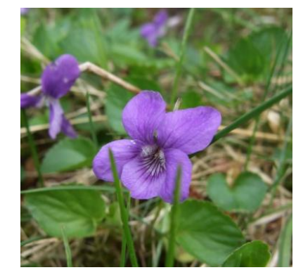
Common Dog Violet © Beth Halski