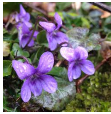
Early Dog Violet ©Trevor Dines